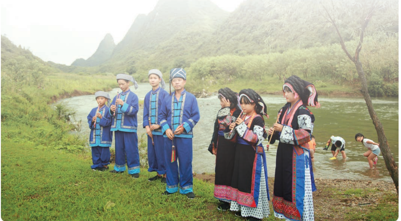
▲ Afforestation - Anhuang, China. Certified by Verified Carbon Standard (VCS)

Join us in leading the way towards a greener future and help protect the planet by addressing carbon emissions through RICOH Carbon Balanced Service.