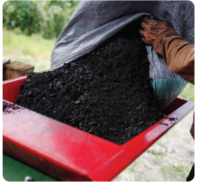
▲ Biochar carbon storage

This approach is highly effective at achieving net zero goals with considerable environmental and social benefits. These include protecting vital ecosystems, increasing biodiversity, and providing economic opportunities for local communities – creating positive impacts that extend far beyond reducing carbon emissions.