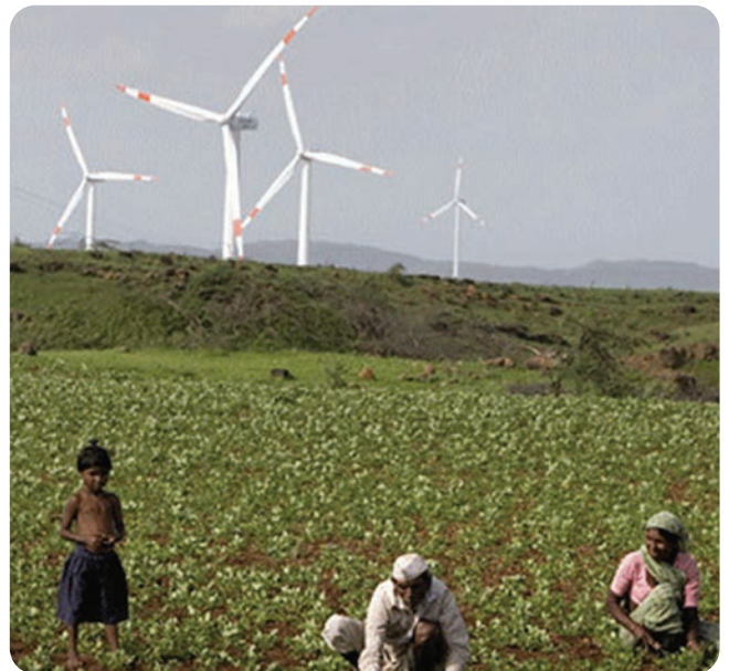
▲ Renewable wind energy, India

When you work with Ricoh, you partner with a company dedicated to environmental responsibility, actively taking strides each year to minimise impact on the planet.